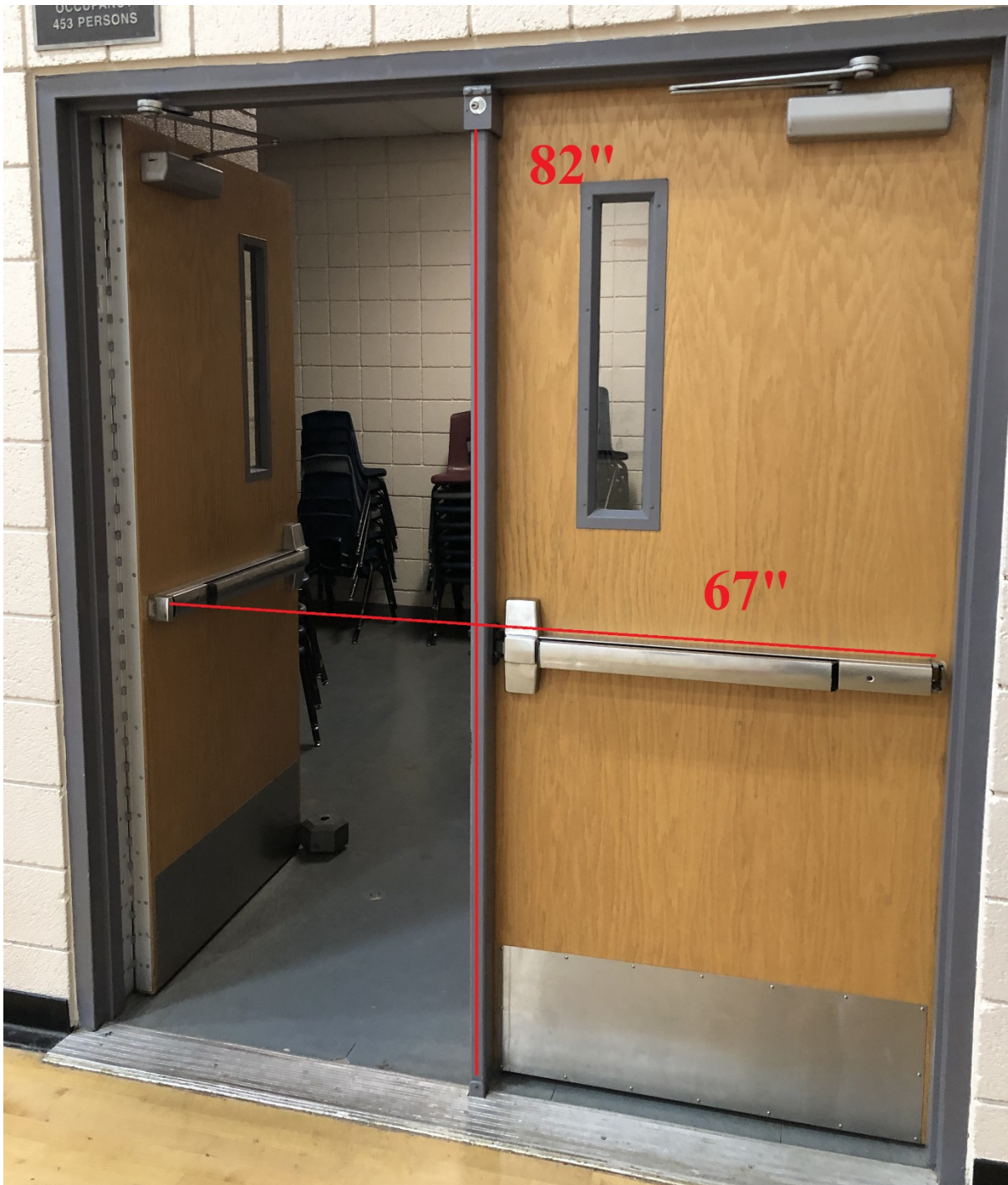
Door #2 Warm up Gym to Hallway 82" X 67"

The above information is being provided to you in order give you the most complete information we currently have on this contest. All information is subject to change either before or during the event by contest personnel based on need.