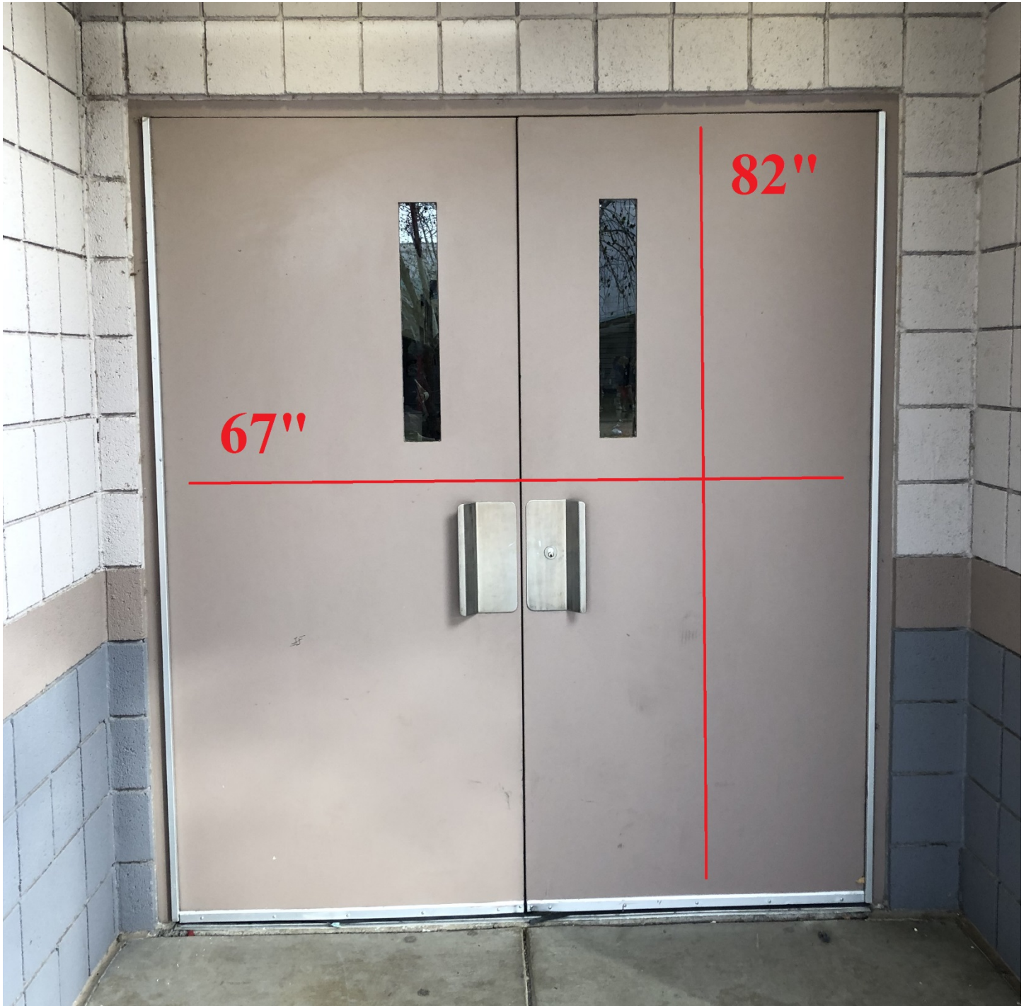
Door #4 Main Gym to Exit - Outdoors 82"X 67"

The above information is being provided to you in order give you the most complete information we currently have on this contest. All information is subject to change either before or during the event by contest personnel based on need.