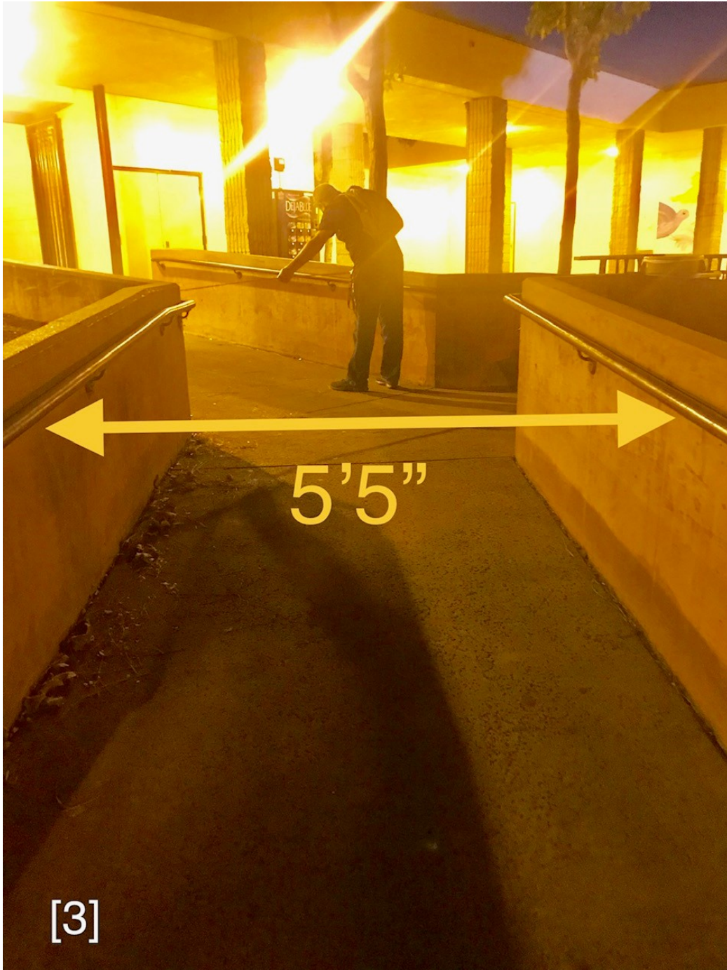
Ramp to warm up area

The above information is being provided to you in order give you the most complete information we currently have on this contest. All information is subject to change either before or during the event by contest personnel based on need.