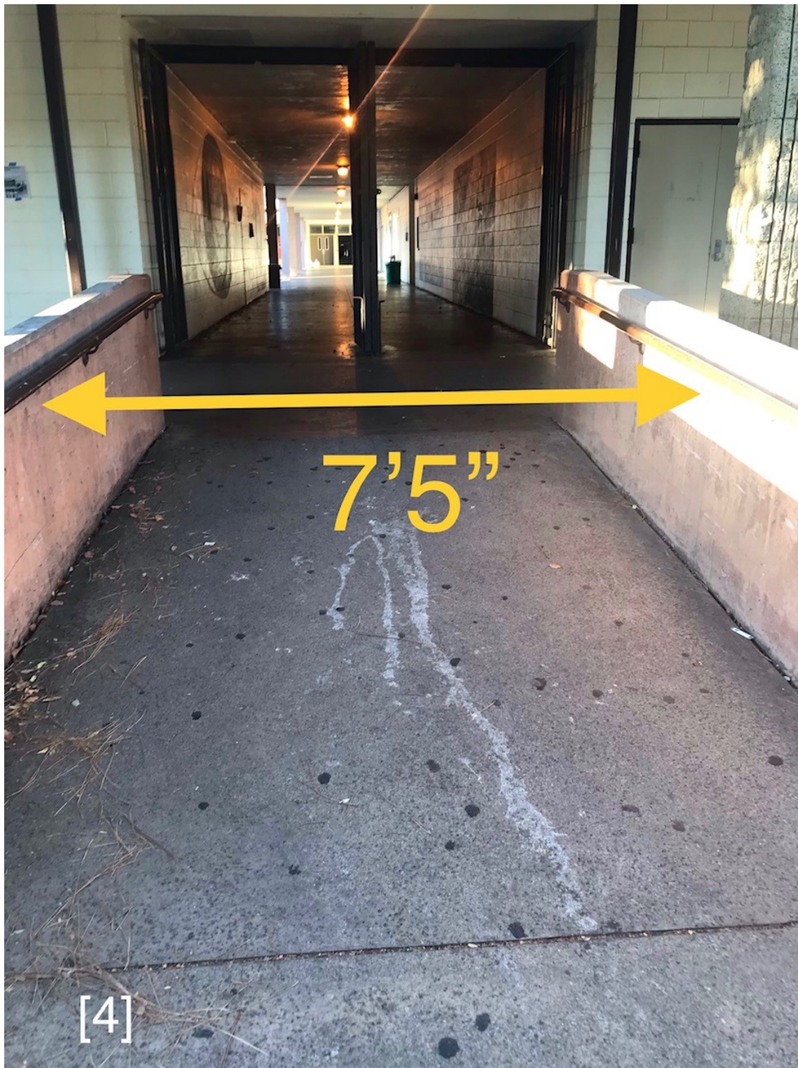
Secondary ramp to warm up area

The above information is being provided to you in order give you the most complete information we currently have on this contest. All information is subject to change either before or during the event by contest personnel based on need.