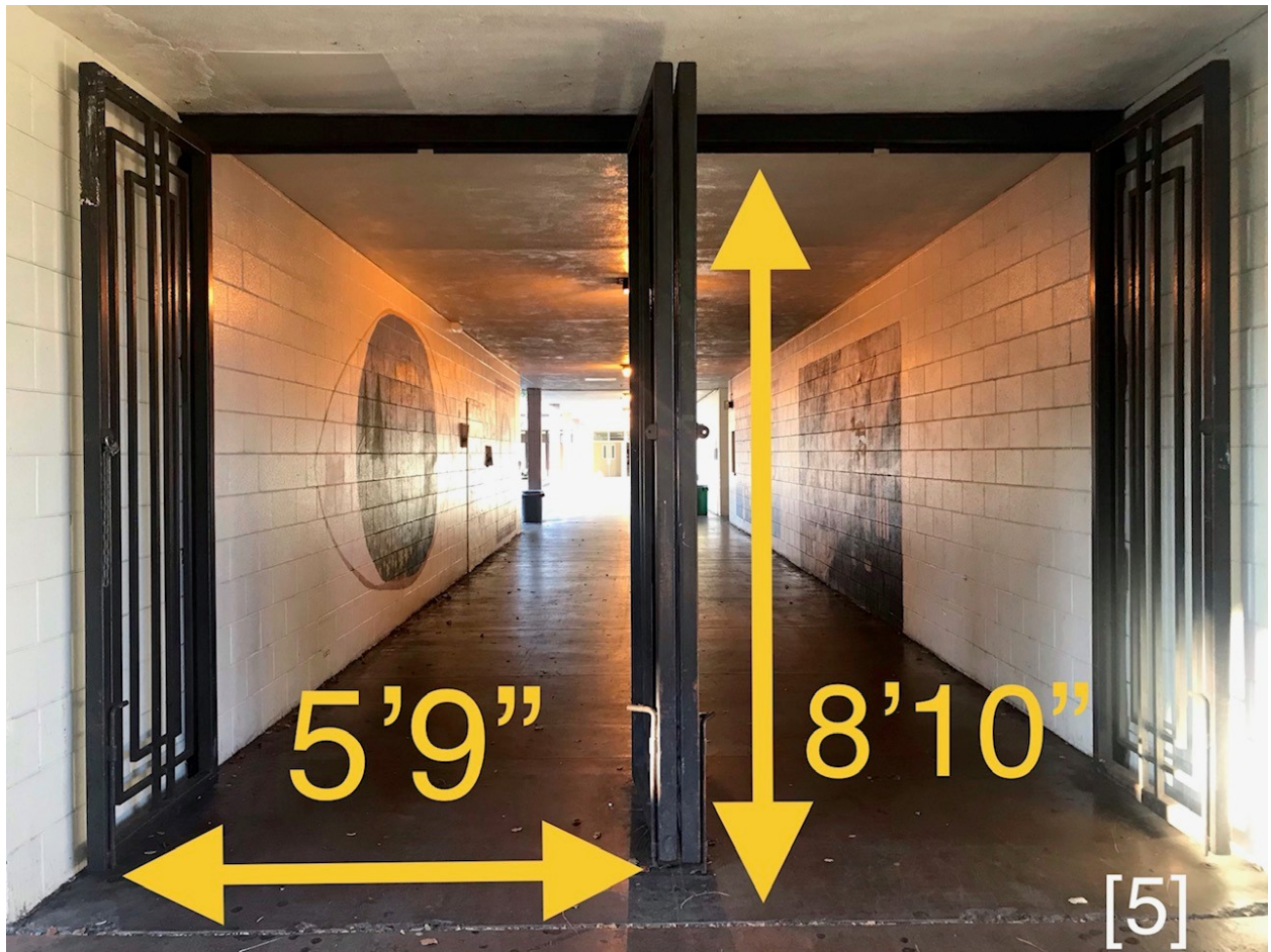
Gate to warm up

The above information is being provided to you in order give you the most complete information we currently have on this contest. All information is subject to change either before or during the event by contest personnel based on need.