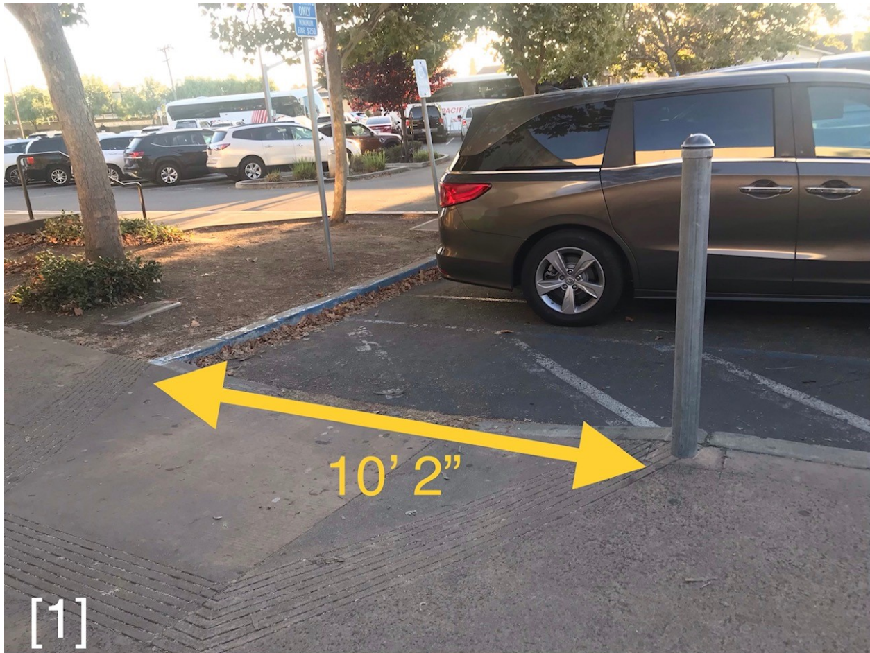
[1] Ramp to performer entry

The above information is being provided to you in order give you the most complete information we currently have on this contest. All information is subject to change either before or during the event by contest personnel based on need.