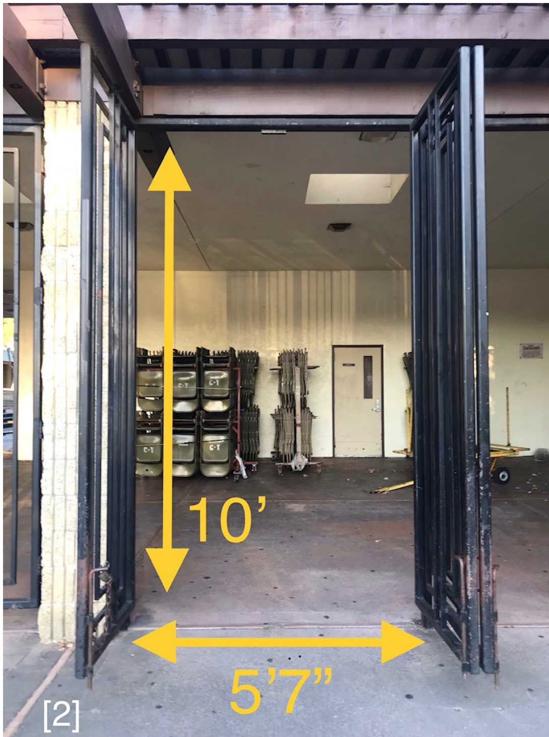
Entry gate to props drop off area

The above information is being provided to you in order give you the most complete information we currently have on this contest. All information is subject to change either before or during the event by contest personnel based on need.