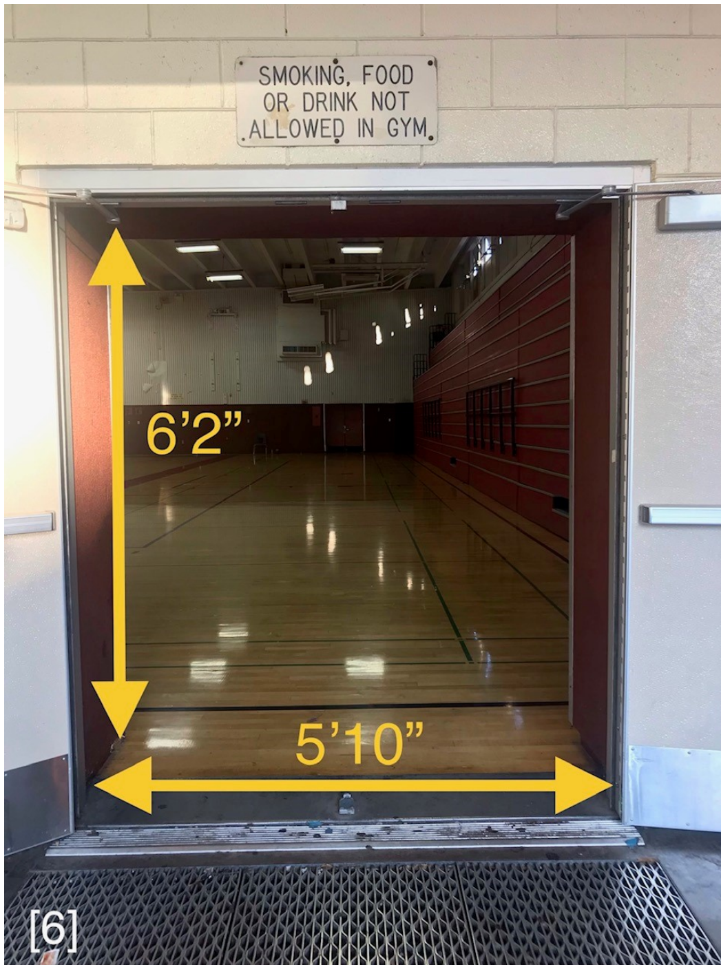
Doors to warm up area

The above information is being provided to you in order give you the most complete information we currently have on this contest. All information is subject to change either before or during the event by contest personnel based on need.